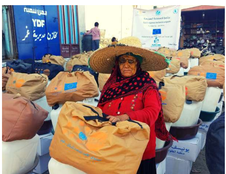
A displaced woman in Sa'ada with her rapid response mechanism kit .