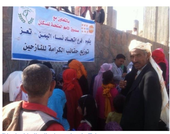
Dignity kit distribution points in Taizz

Pregnancies that can end in miscarriages and unsafe abortions in the next 9 months