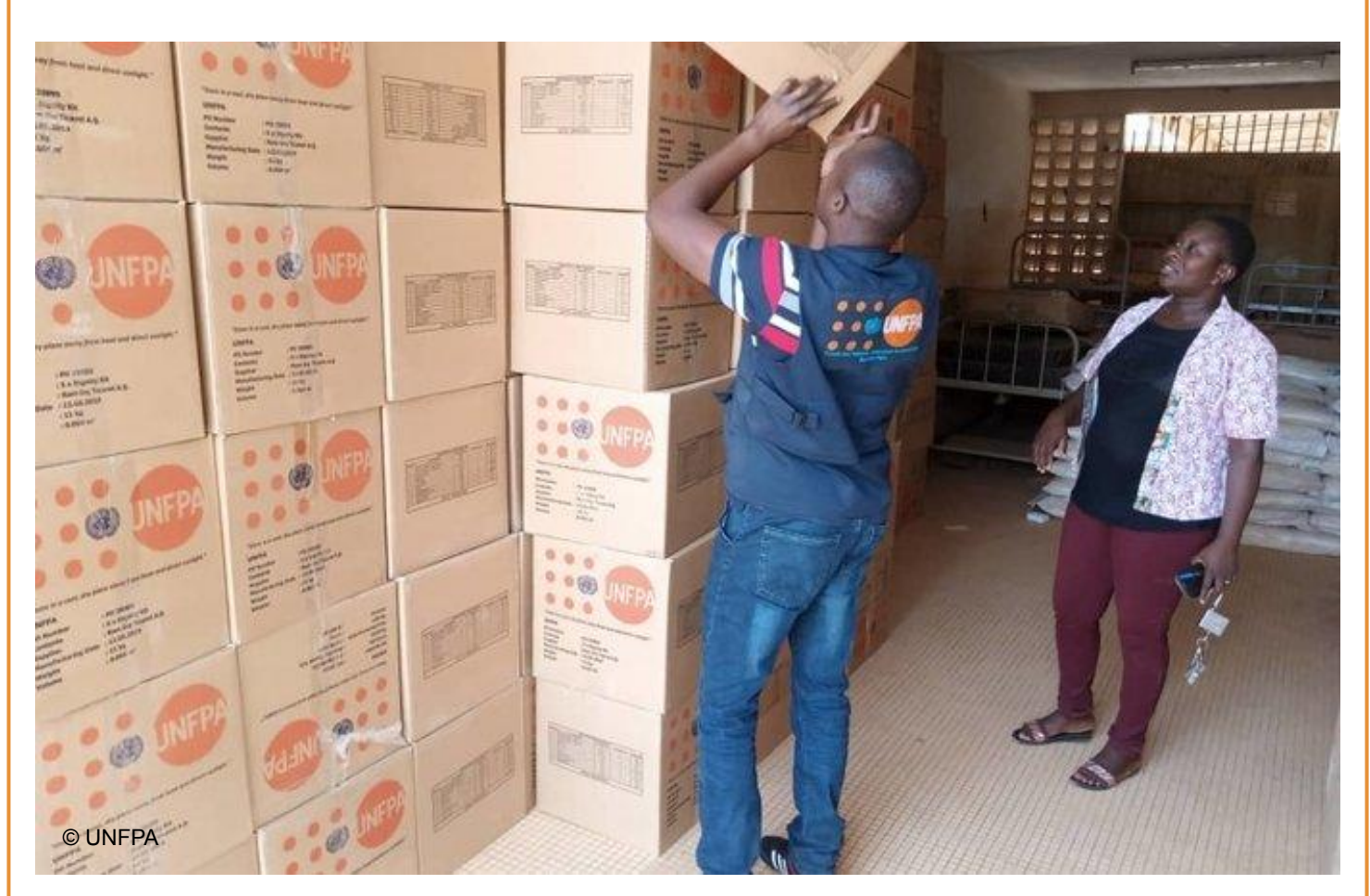
4,000 dignity kits made available in Barsalogho and Djibo for women of childbearing age and vulnerable pregnant women. UNFPA Burkina Faso.

In Senegal for example, UNFPA is supporting girls' clubs at community levels to install 247 washing points (commonly called "Tipi Tapa") to overcome the lack of potable and promote hand washing in their villages. And in Guinea Bissau, UNFPA is partnering with the Ubuntu Guinea-Bissau Academic, with over a 1000 youth network, to raise awareness against COVID-19