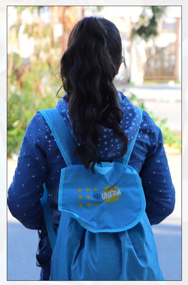
Following the devastating earthquakes, UNFPA and partners are assessing need, providing psychosocial support, and dignity kits.